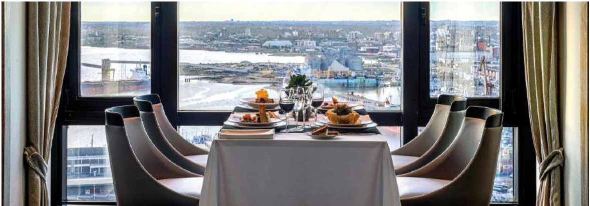
Radisson Hotel cocktail floor 25 Salón Arcadia Montevideo Uruguay